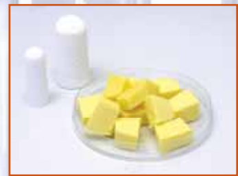
Fat determination in food and feed